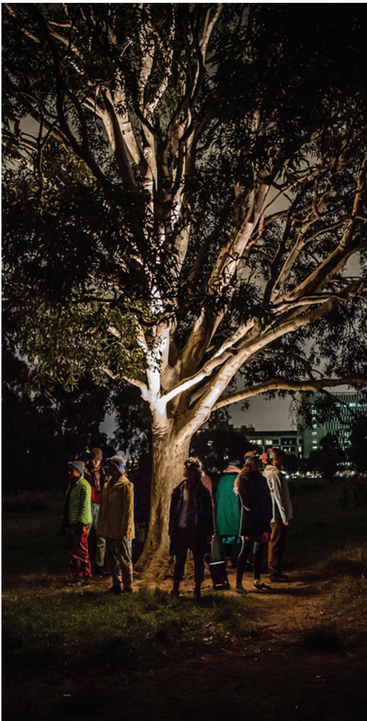
Performers and tree during SHORE in Naarm .

ARTISTIC MOVEMENT A tendency or a style of art with a particularly specified objective and philosophy that is adopted and followed by a group of artists during a specific time period.